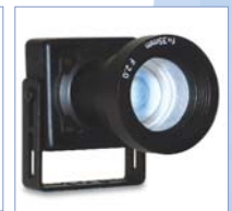
E-B350 35 mm Lens