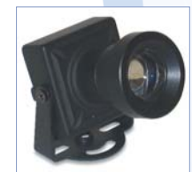
25 mm Lens Fitted to an E-636S-F36 Camera