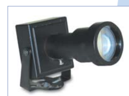
E-B500 50 mm Lens