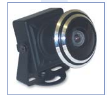
FishEye Lens Fitted to an E-636S-F36 Camera