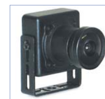
E-B2162 2.1 mm Lens