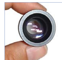
25 mm Board Lens